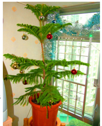
Our Tropical Christmas Tree ...

boots! Or maybe use a butter knife to carve it. We have a real live Christmas tree, a Norfolk Island Pine, and we have decorated a bit. It is really funny to go down in the center of our complex, and