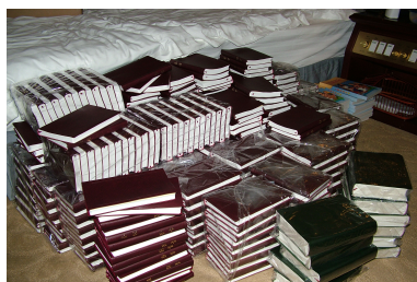
Precious Cargo, One suitcase ...