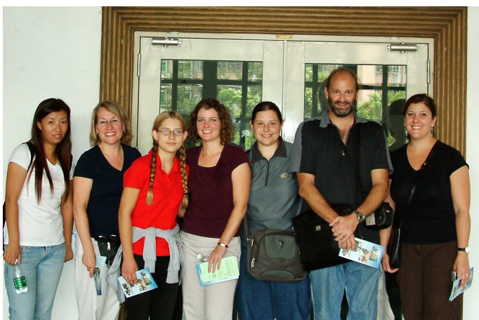
Here we are at the Protestant Three Self Church

From there we were taken to the Protestant Three Self Church. This church is quite large and is also new. We were met by two ladies with the largest set of keys I have seen in my life. Every door was locked and barred. There were two sanctuaries, as well as a school of some kind. We were told that the church had an attendance of 6,000 people on Sundays. And that they had a book store. We noted that there were Bibles in the pews as well as hymnals. We asked if we could buy some Bibles and they said we could. This proved true. There was a small book store in the basement where we were allowed to buy some Bibles. (We found out later that one of our co-workers had gone to this church and had looked in to buying Bibles in bulk but that he was not allowed to without first registering with the government and stating their use.)