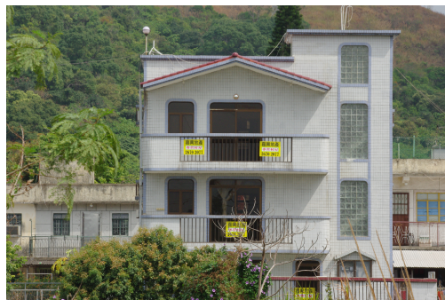
4A, 2/F Sheung Shui Wa Shan Tseun, OUR NEW RESIDENCE! We get the top floor which comes with the roof. We even can have a garden, and grow some veggies!

We discovered that there was a "river" behind Sheung Shui, (Actually it's a really big drainage ditch.) but there is a service road beside