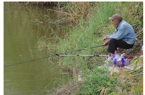
Our new Neighborhood!

discovered that there was a house for rent. We actually have known about it for a while but have not been able to connect with the owners about it. We sat on the steps several times and prayed fervently that if God wanted us there, that HE would make it possible, and affordable. Its twice the square feet of our flat now (not even counting the roof), and it is $100.00HK less. PRAISE THE LORD! God answered BOTH of our prayers by giving us a lease on this place, (2 Years) and we can rent it as a storage place for our stuff while we are in the States for less than normal storage fee's, And we only have to move ONCE. PRAISE THE LORD!