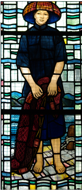
A turn of the century stained glass from a Anglican Church in Hong Kong ...

You know that there is a lot of difference between Giving Thanks, and Thanksgiving. Don't get me wrong, I love turkey, stuffing, and the rest. (In fact we are having 2 Thanksgiving Holidays this year). But Giving Thanks is something that we need to be doing every single day of our lives. I mean, down on our knees, face to the ground, praising God for His goodness. Which by the way, that Goodness, I do not deserve, in the least.